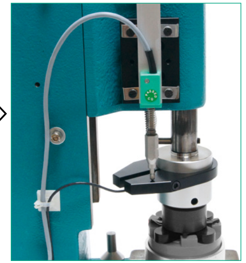
Figure 1.10: Display and press process...

Then the numerical display shows Step 2, set modes.