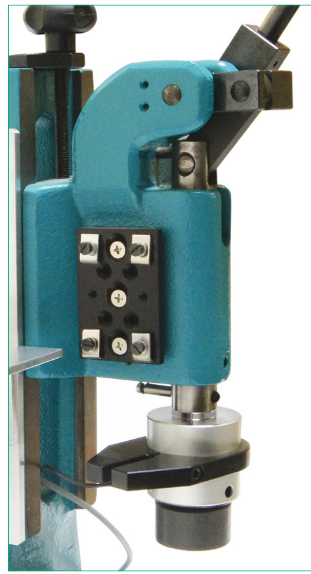
Figure 1.4: Displacement measuring system on the press Page 8

Another way to mount the displacement sensor is illustrated in data sheet 8552, in case there is no room on the press head.