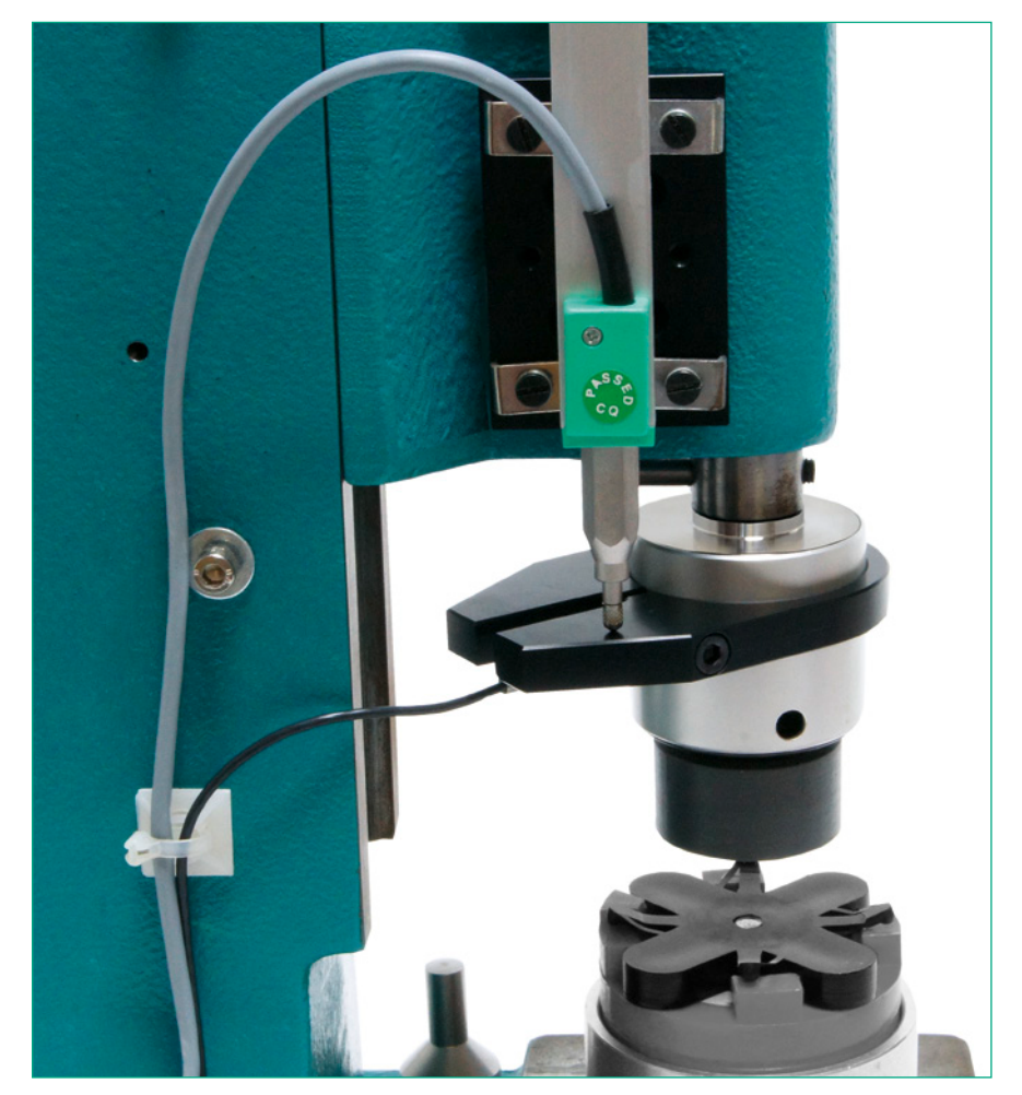
Figure 1.5: Displacement measuring system in the raised position