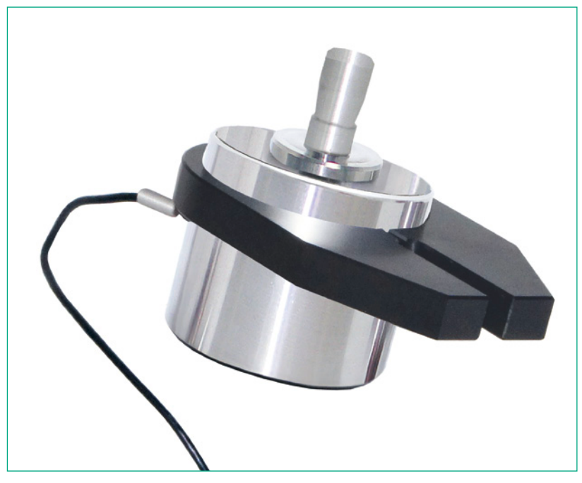
Figure 1.1: Fitting the carrier on the load cell

Slide the carrier (supplied in mounting kit 5501-Z004) over the load cell from the peg end and clamp it carefully on the upper edge of the load cell (figure 1.1); maximum tightening torque 3 Nm.