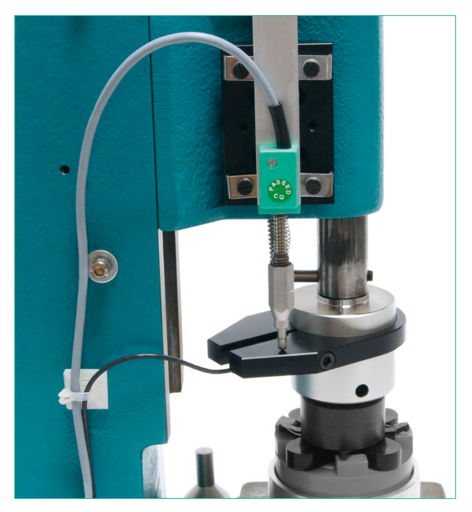
Figure 1.6: Displacement measuring system in the lowered position

Now check the operation of the press in the lowered position (bottom dead center BDC) by moving the press ram carefully downwards. The displacement sensor must travel with it smoothly and with no transverse forces acting on, and must not reach its lower limit of travel in the BDC. Make sure that the sensing tip is resting on the load-cell carrier (Figure 1.6).